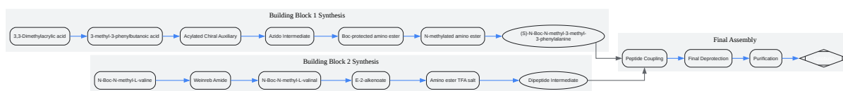
Diagram of Convergent Synthesis Workflow:

Click to download full resolution via product page