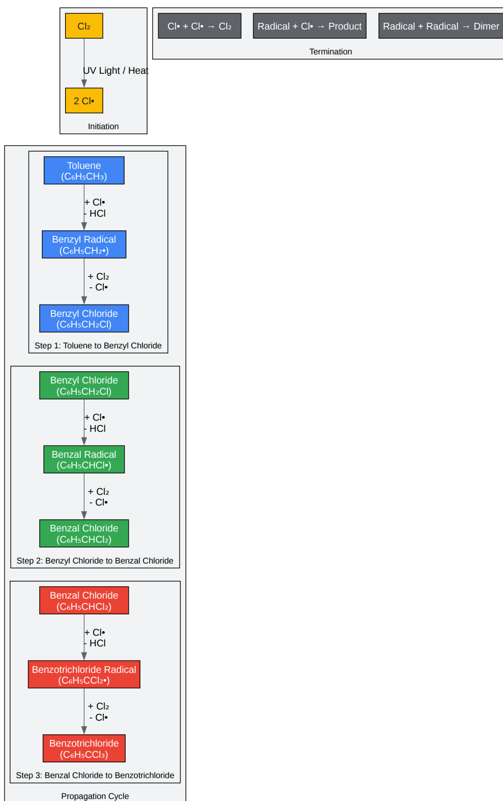
Figure 1: Free-Radical Chlorination Mechanism of Toluene

Click to download full resolution via product page