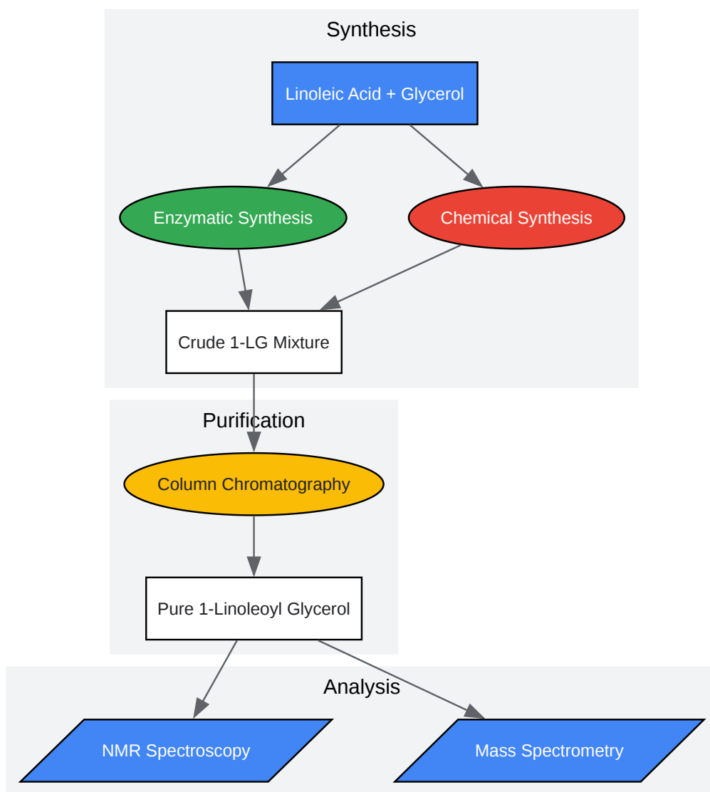
Figure 1. General Workflow for 1-Linoleoyl Glycerol Synthesis and Purification

Click to download full resolution via product page