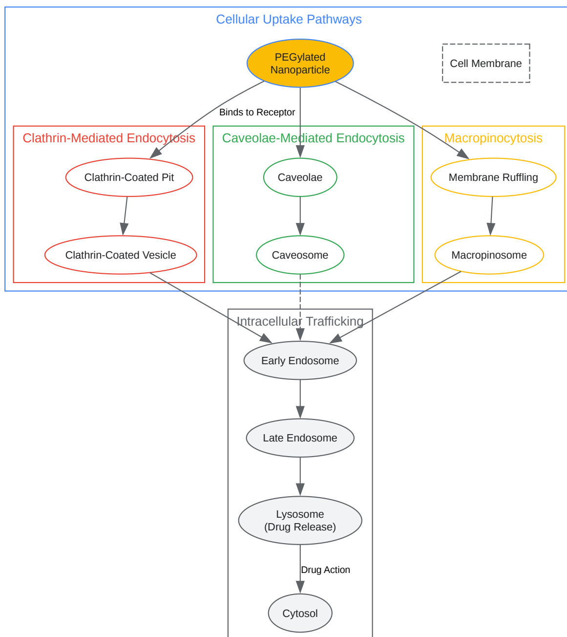
Figure 1. Experimental workflow for the surface modification of nanoparticles with Bis-PEG4-acid .