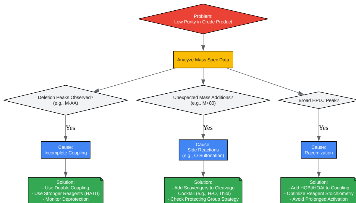
Figure 2. Troubleshooting Guide for Low Peptide Purity

Click to download full resolution via product page