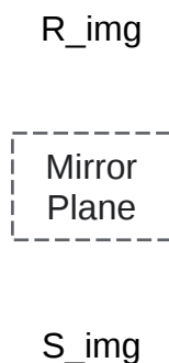
Figure 1. Enantiomers of 1,3-Hexanediol

Click to download full resolution via product page