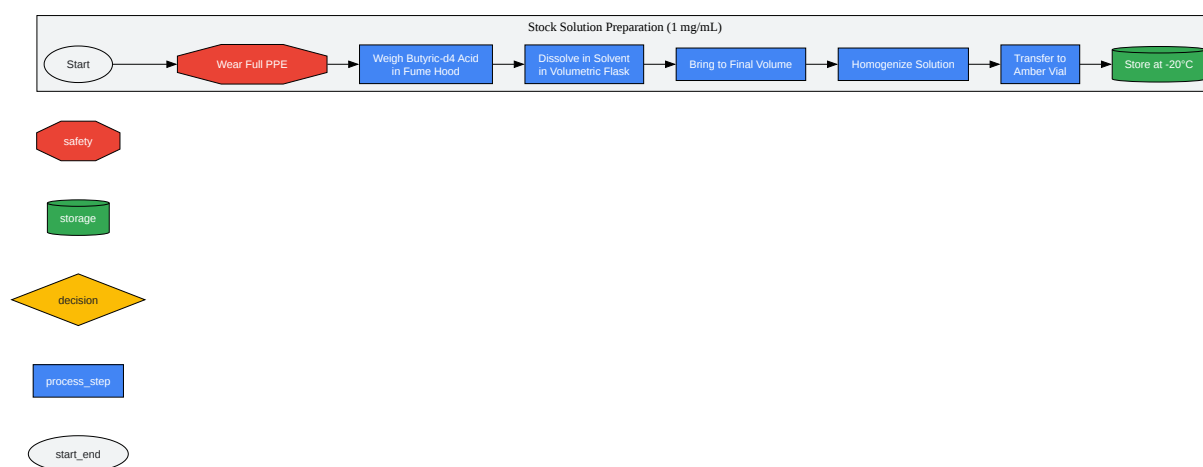
Figure 1: Workflow for Preparing Butyric-d4 Acid Stock Solution.

Click to download full resolution via product page