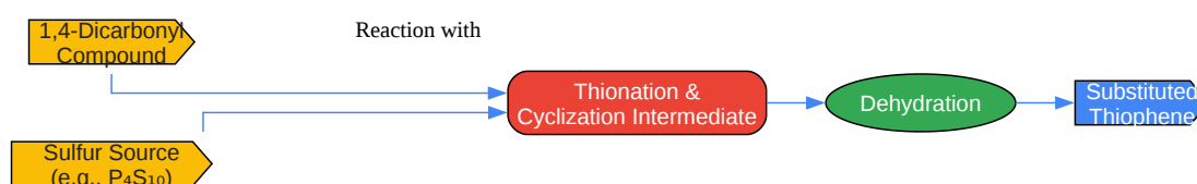
Paal-Knorr Thiophene Synthesis Workflow

Click to download full resolution via product page