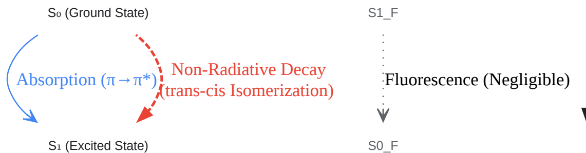
Jablonski Diagram for Azobenzene

Click to download full resolution via product page