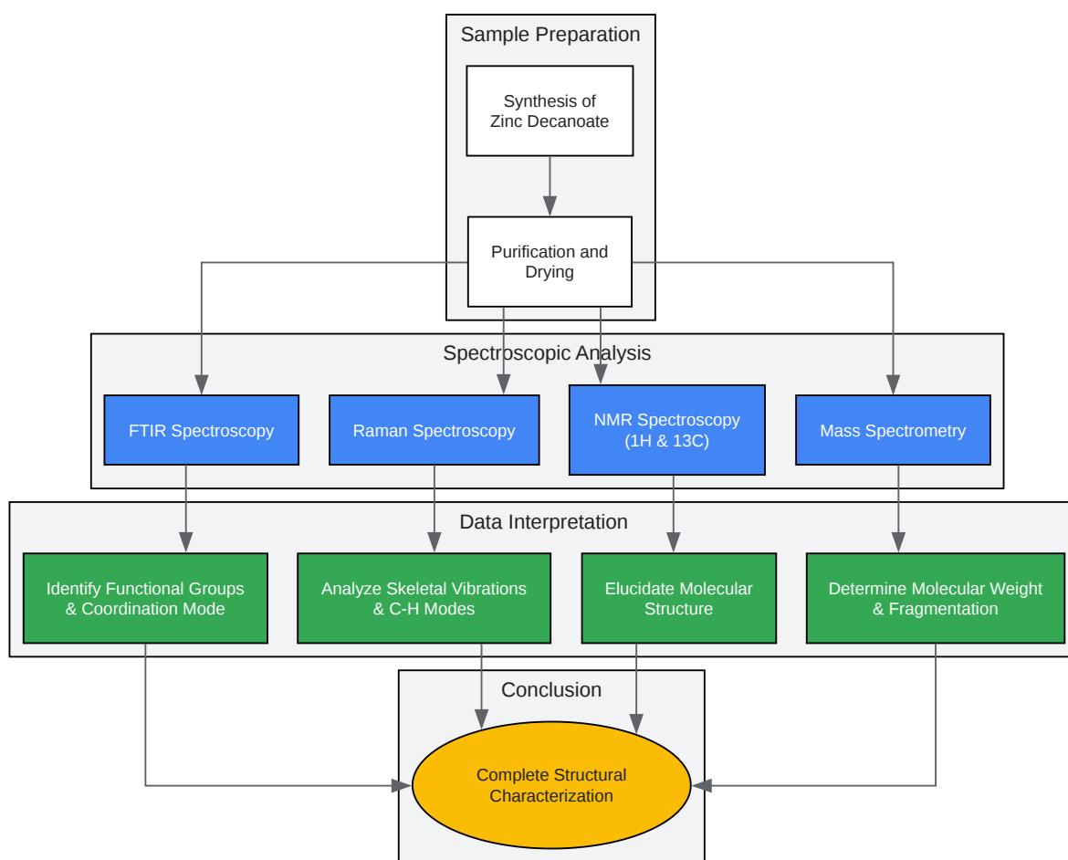
General Workflow for Spectroscopic Characterization

Click to download full resolution via product page