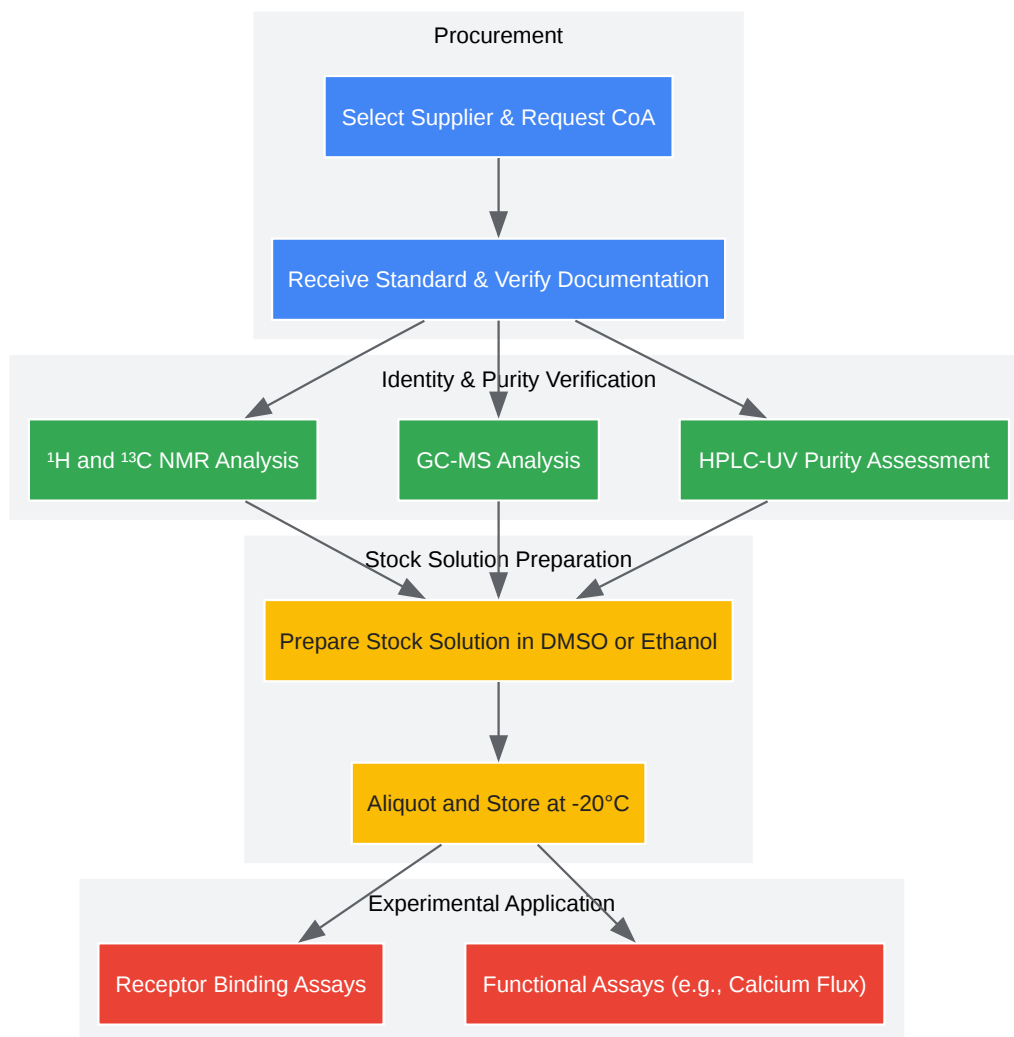
Figure 1. Workflow for Methallylescaline Standard Handling

Click to download full resolution via product page