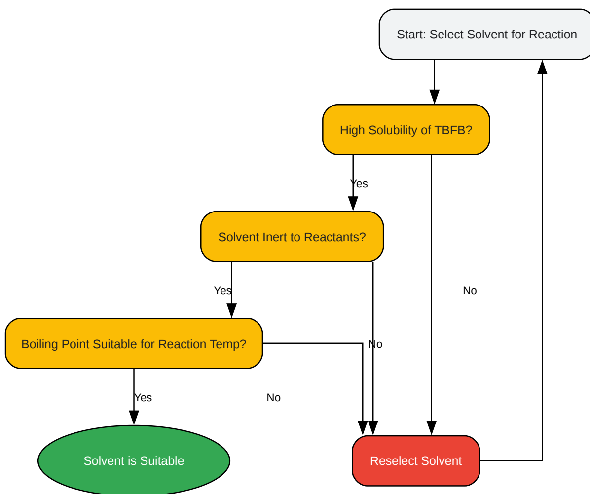
Diagram 2: Solvent Selection Logic for Reactions Involving 4-tert-butyl-4'-fluorobenzophenone

Click to download full resolution via product page