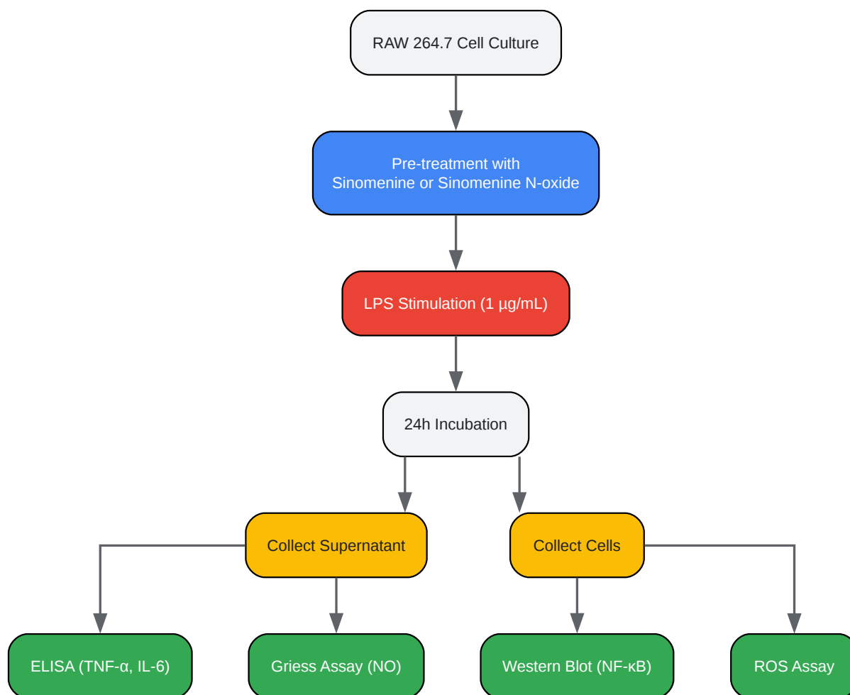
Figure 1: Simplified NF- \kappa B signaling pathway showing the inhibitory action of Sinomenine and the limited effect of Sinomenine N-oxide .

Click to download full resolution via product page