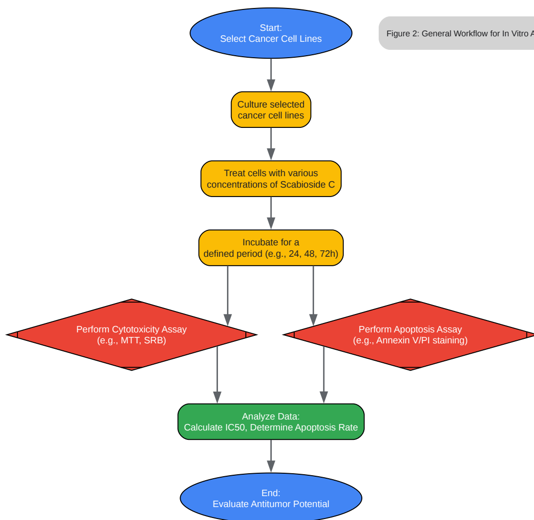
Figure 2: General Workflow for In Vitro Antitumor Activity.

General Experimental Workflow for In Vitro Antitumor Assays: