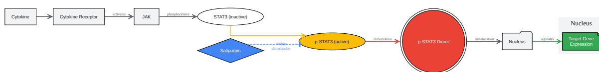
Diagram of the STAT3 Signaling Pathway and the inhibitory action of Salipurpin :

Click to download full resolution via product page