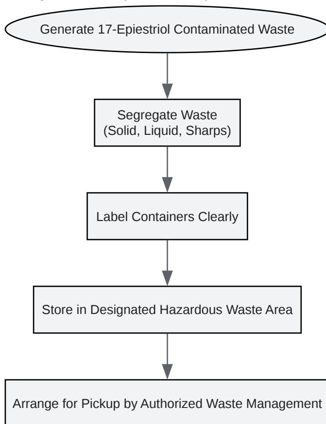
Figure 3: 17-Epiestriol Disposal Workflow

Click to download full resolution via product page