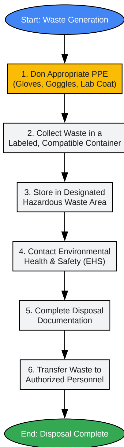
Figure 2. Step-by-Step Disposal Workflow

Click to download full resolution via product page