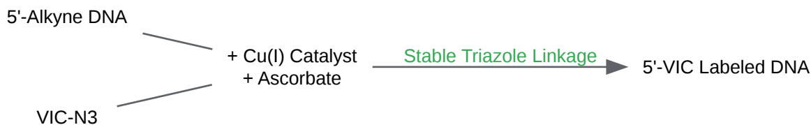
Figure 2: Click Chemistry Reaction Pathway

Caption: Overall workflow for the synthesis, purification, and application of 5'-VIC labeled DNA probes.