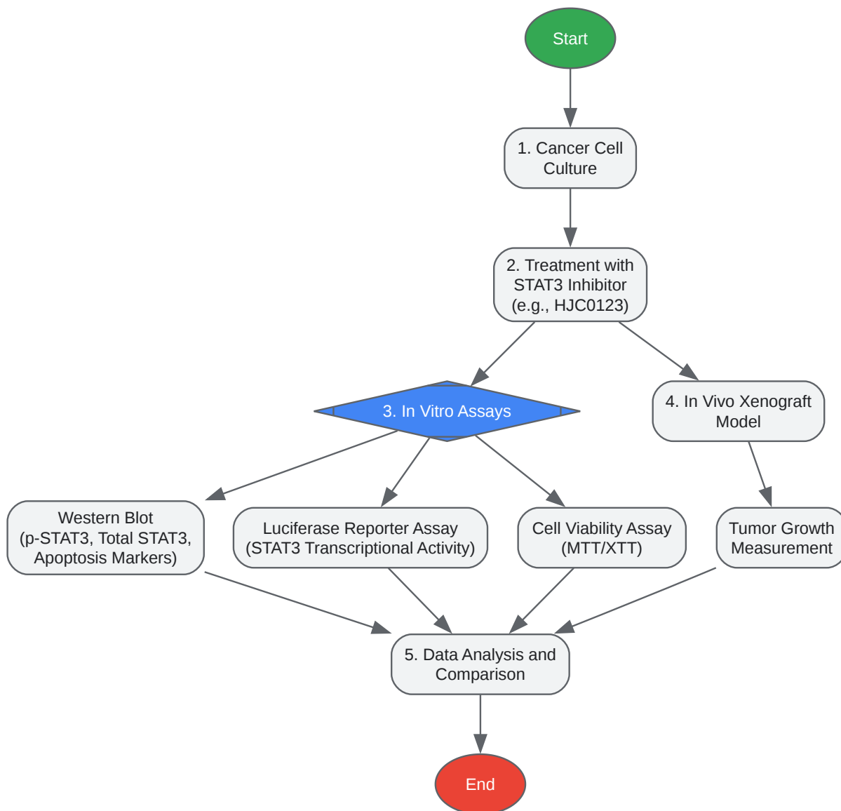
General Workflow for STAT3 Inhibitor Evaluation

Click to download full resolution via product page