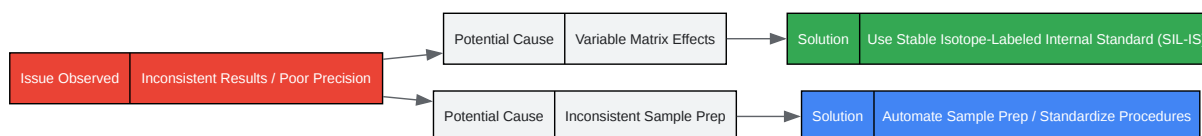
Caption: Workflow for Indican sample preparation and analysis.

Click to download full resolution via product page