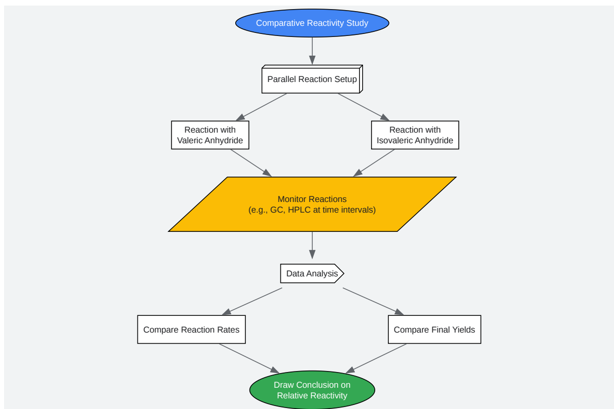
Caption: Mechanism of Friedel-Crafts Acylation.

Click to download full resolution via product page