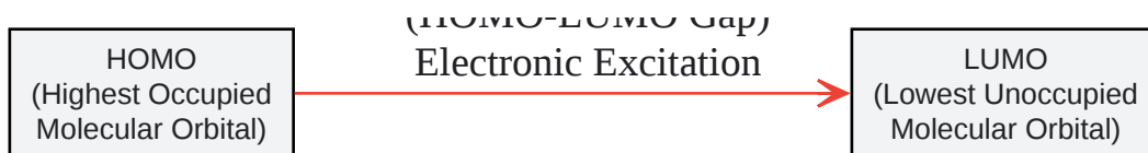
Relationship between HOMO, LUMO, and Electronic Excitation