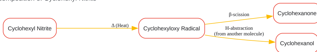
Thermal Decomposition of Cyclohexyl Nitrite

Click to download full resolution via product page