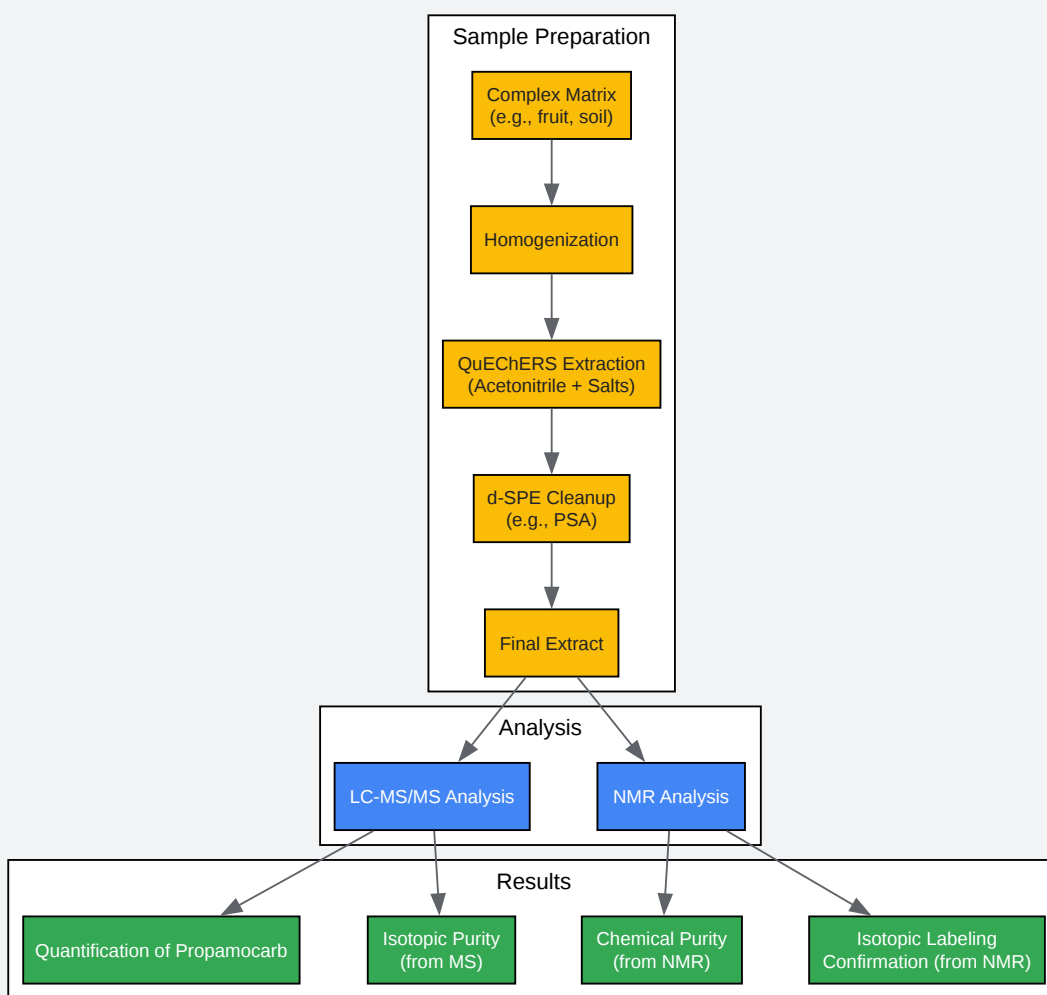
Workflow for Analysis and Purity Confirmation of Propamocarb-d7