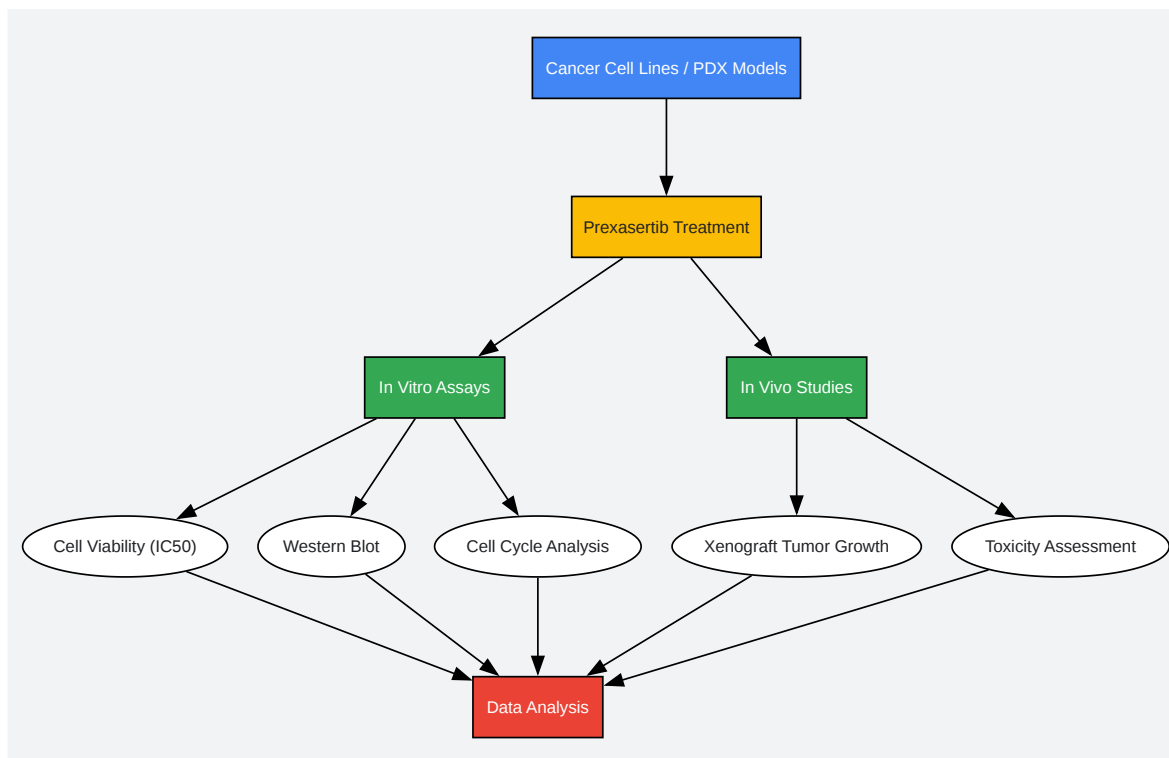
Preclinical Evaluation Workflow for Prexasertib

Click to download full resolution via product page