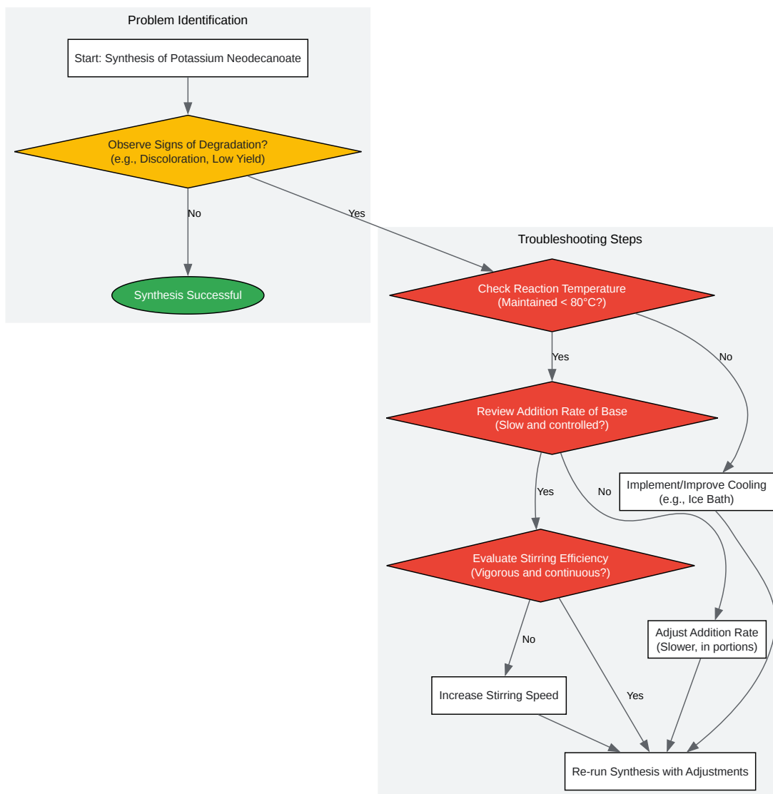
Troubleshooting Workflow for Thermal Degradation

Click to download full resolution via product page