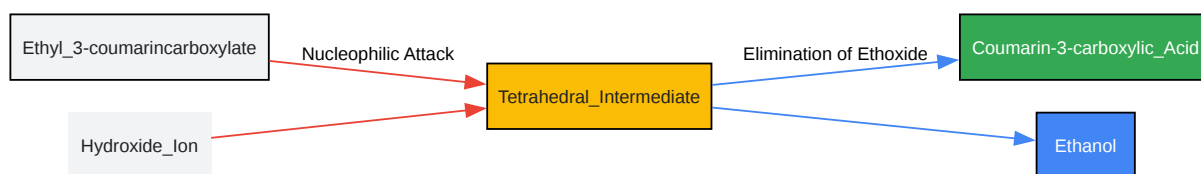
Figure 1. General Mechanism of Base-Catalyzed Ester Hydrolysis