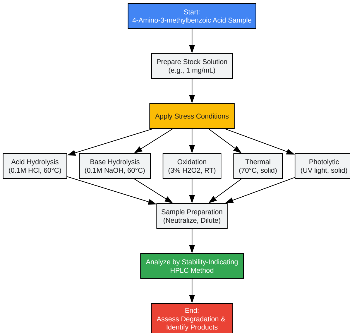
Figure 2: Experimental Workflow for Stability Assessment

Click to download full resolution via product page