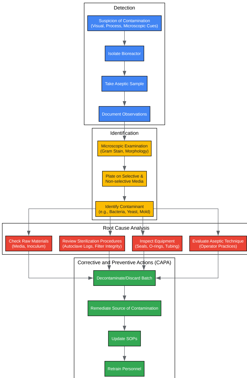
Figure 1. Contamination Troubleshooting Workflow

Click to download full resolution via product page