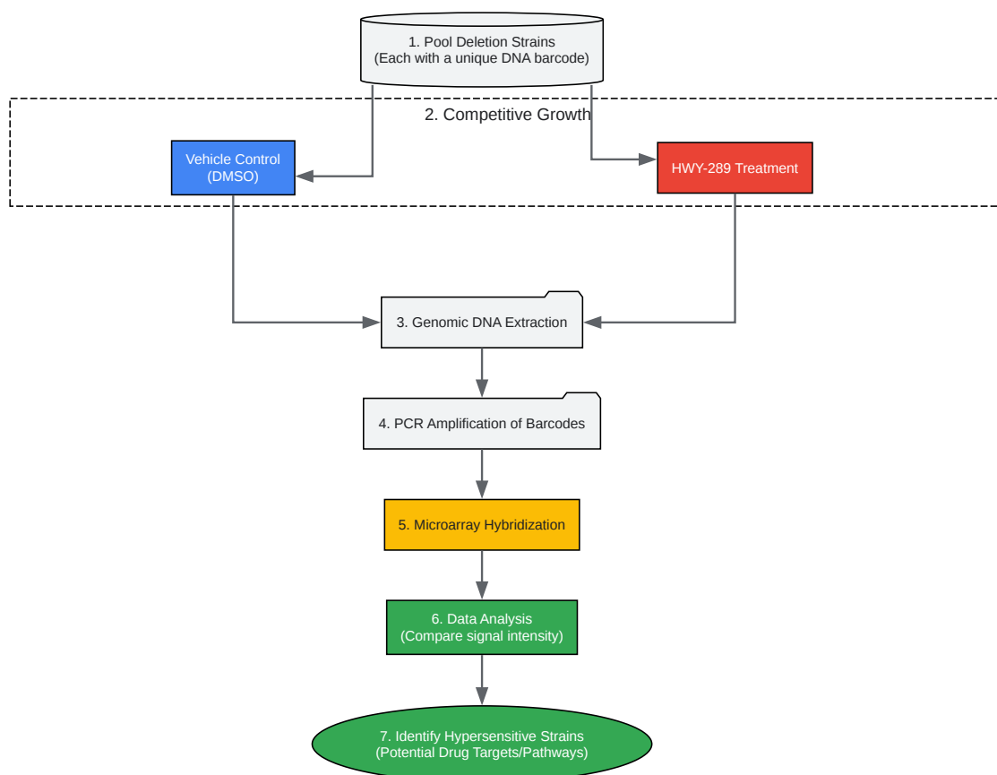
Figure 2: Chemogenomic Profiling Workflow

Click to download full resolution via product page