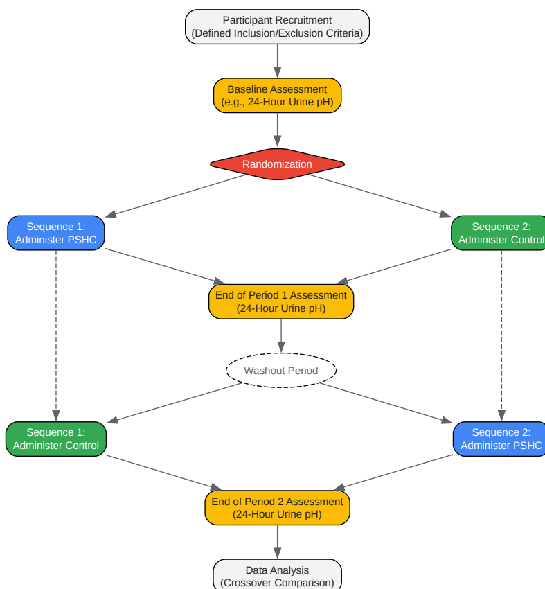
Figure 2. Experimental Workflow for a Crossover Clinical Trial

Click to download full resolution via product page