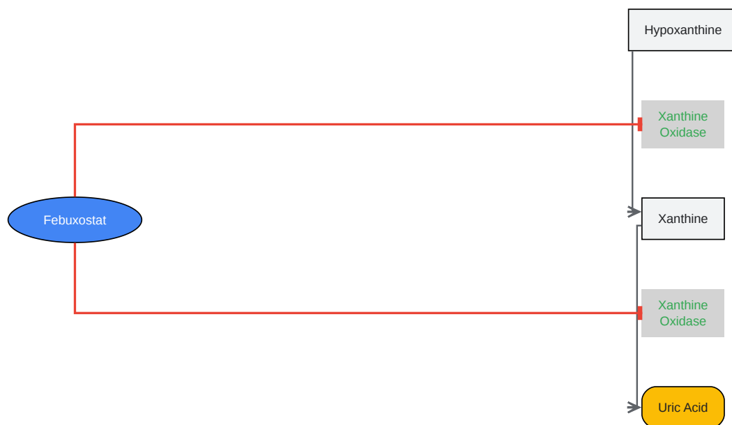
Mechanism of Action of Febuxostat

Click to download full resolution via product page