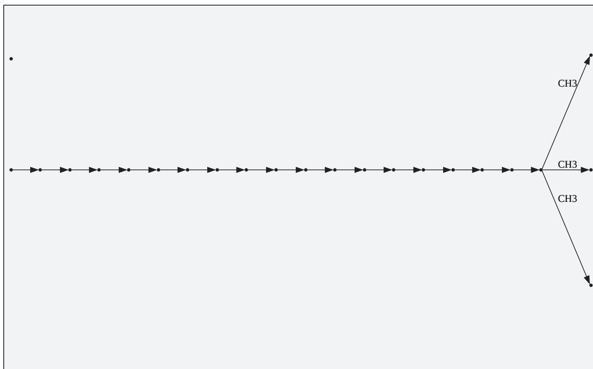
Molecular Structure of Stearyltrimethylammonium Chloride

Click to download full resolution via product page