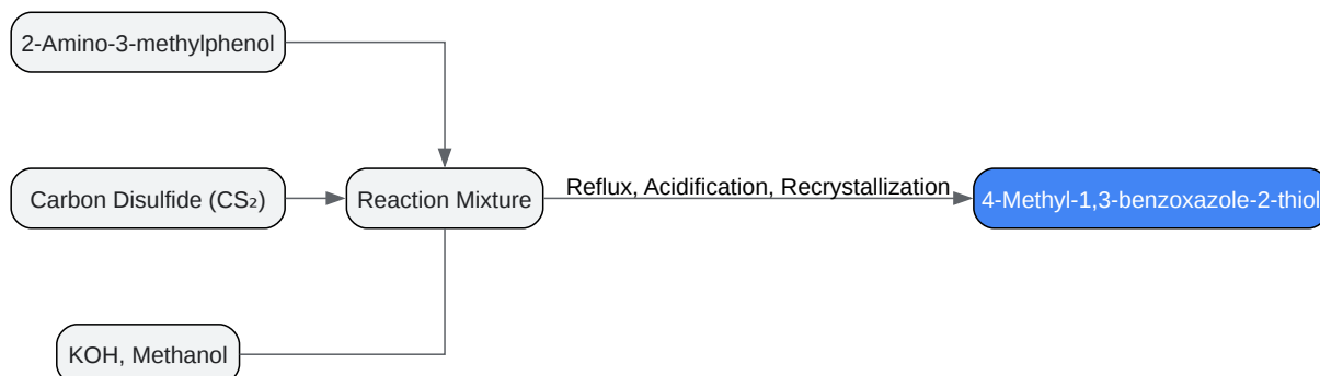
Diagram of Synthetic Workflow

Click to download full resolution via product page