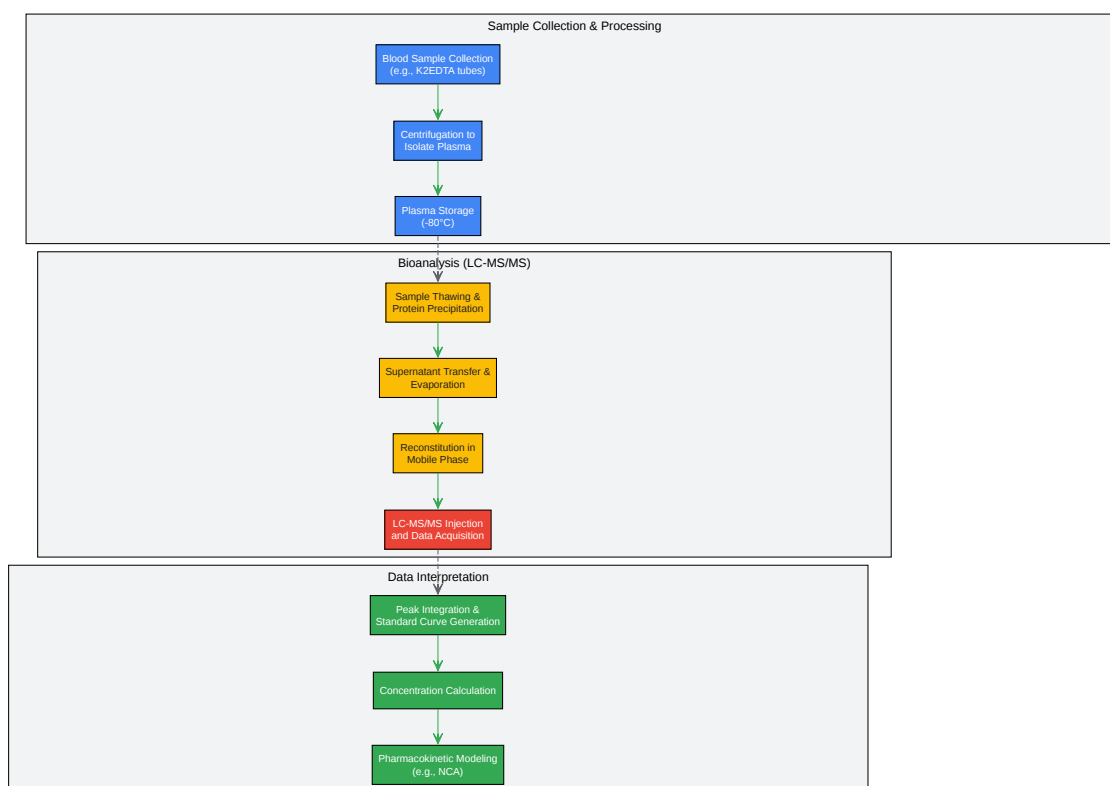
Diagram: General Workflow for PK Sample Analysis

Click to download full resolution via product page