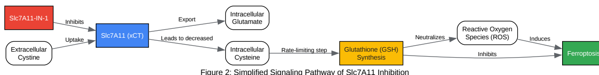
Figure 2: Simplified Signaling Pathway of Slc7A11 Inhibition

Click to download full resolution via product page