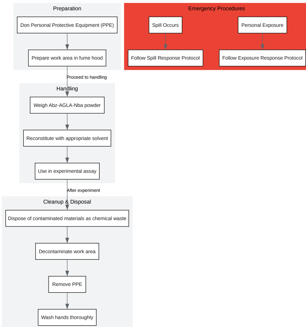
Workflow for Safe Handling of Abz-AGLA-Nba

Click to download full resolution via product page