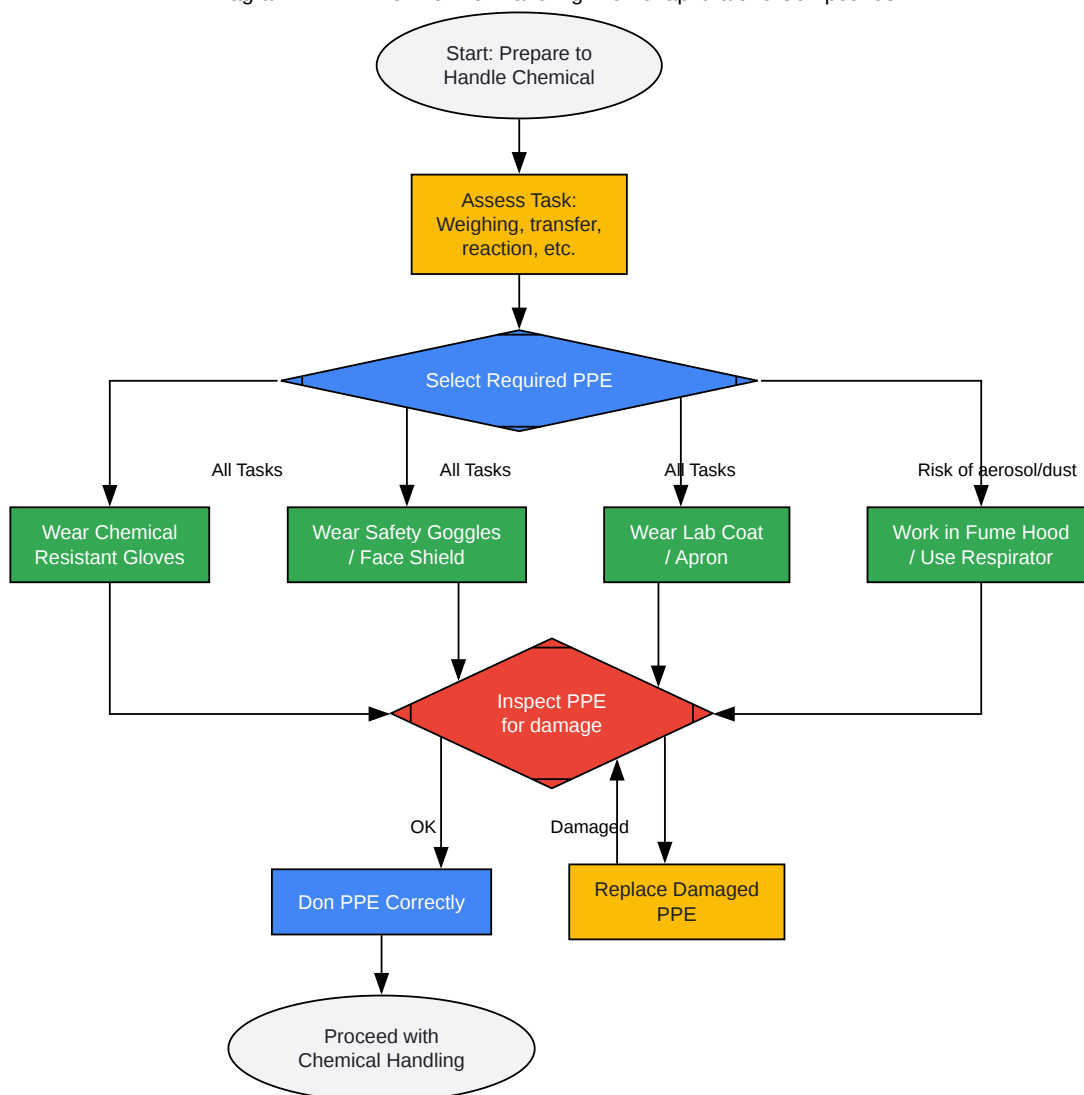
Diagram 1: PPE Workflow for Handling Bromonaphthalene Compounds

Click to download full resolution via product page