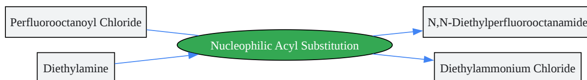
Diagram 3: Amidation of Diethylamine

Click to download full resolution via product page