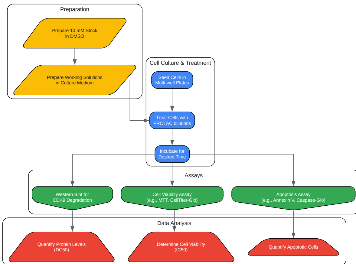
Experimental Workflow for PROTAC CDK9 Degradation Evaluation

Click to download full resolution via product page