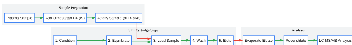
Diagram 1: General Workflow for Solid-Phase Extraction (SPE)

Click to download full resolution via product page