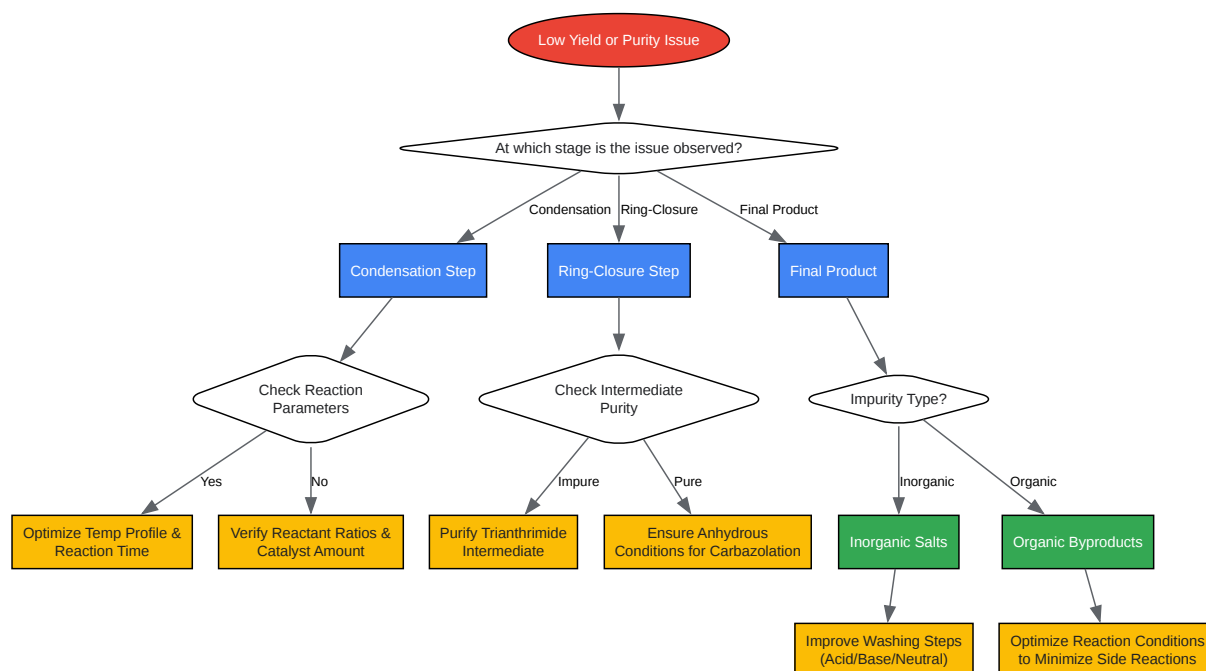
Caption: Overall synthesis workflow for Vat Brown 1 .

Click to download full resolution via product page