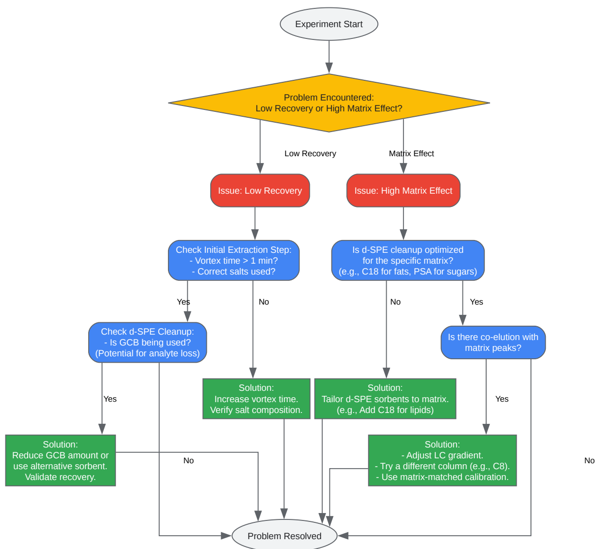
Figure 2: Troubleshooting Decision Tree

Click to download full resolution via product page