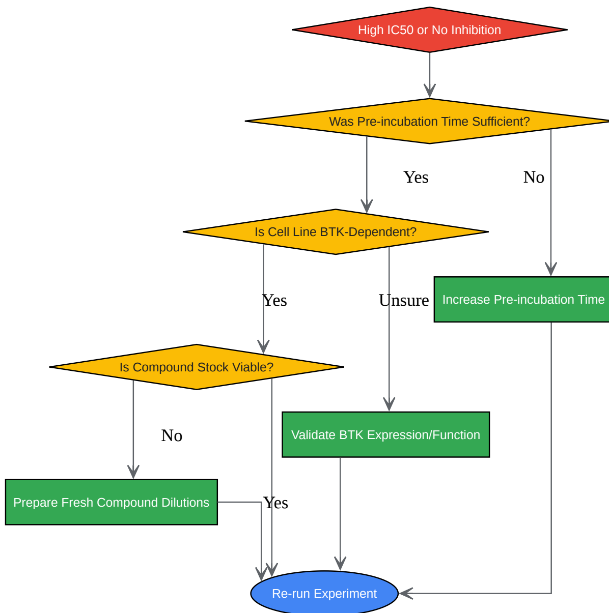
Caption: General experimental workflow for determining the IC50 of ABBV-992 in a cell viability assay.

Click to download full resolution via product page