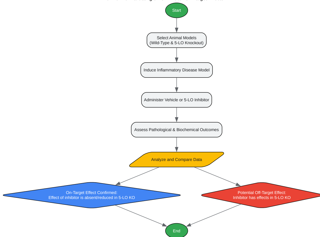
Workflow for Validating 5-LO Inhibitor On-Target Effects

Click to download full resolution via product page