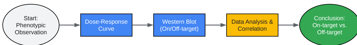
Caption: Potential off-target signaling of high-concentration AZD1208.

Click to download full resolution via product page