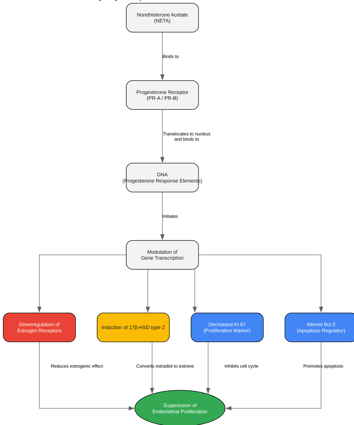
Signaling Pathway of Norethisterone Acetate in Endometrial Cells