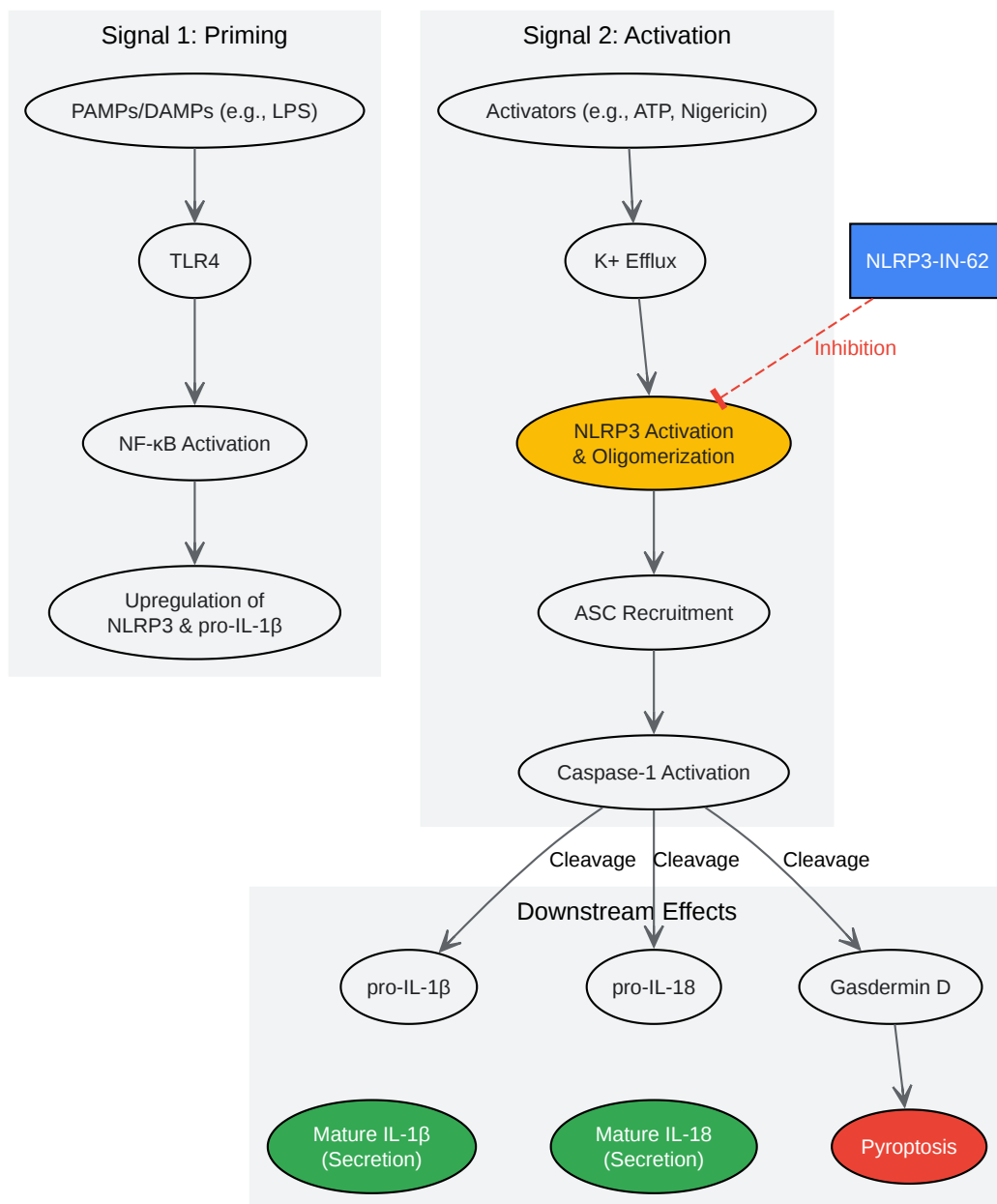
Canonical NLRP3 Inflammasome Activation Pathway

Click to download full resolution via product page