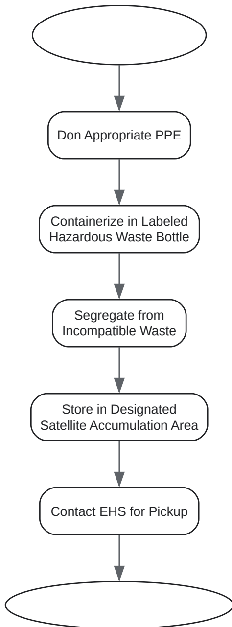
Figure 1: MK-0668 Waste Disposal Workflow

Click to download full resolution via product page