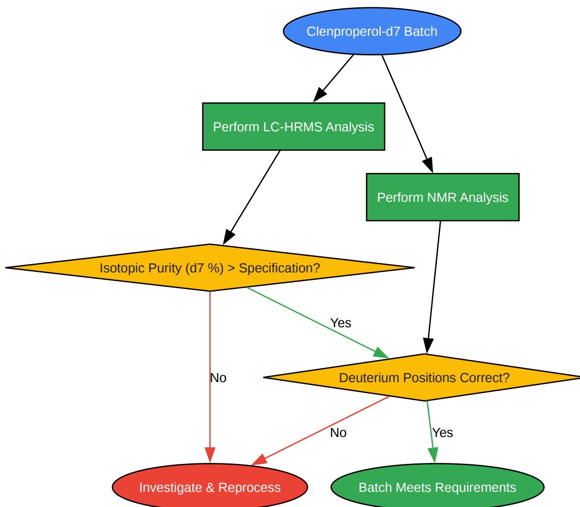
Figure 2: Decision Pathway for Isotopic Purity Evaluation

Click to download full resolution via product page